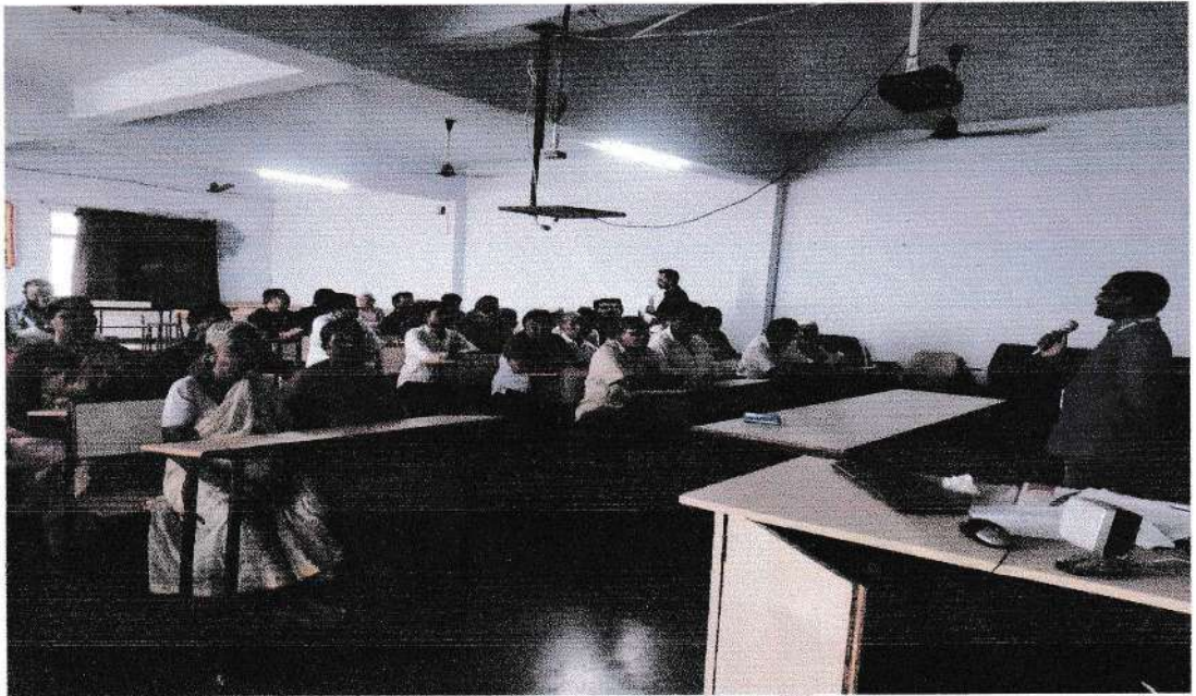
Photographs Related to the Discipline Specific Curriculum Development for Professional Development of Staff Event